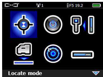
F5 Receiver Main Menu

The FSD's screen is normally dedicated to the transmitter's roll clock. When the receiver takes a depth reading, the FSD automatically adjusts to also display depth.